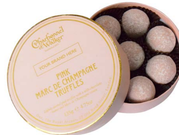
135g Pink Marc de Champagne Truffles

(Dimensions for your branding are 65mm W x 18mm H. All prices ex. VAT.)