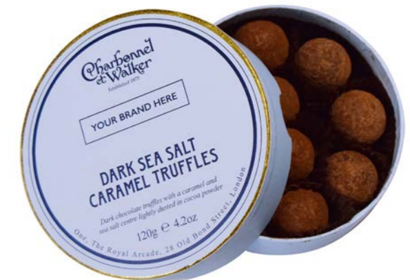
120g Dark Sea Salt Caramel Truffles