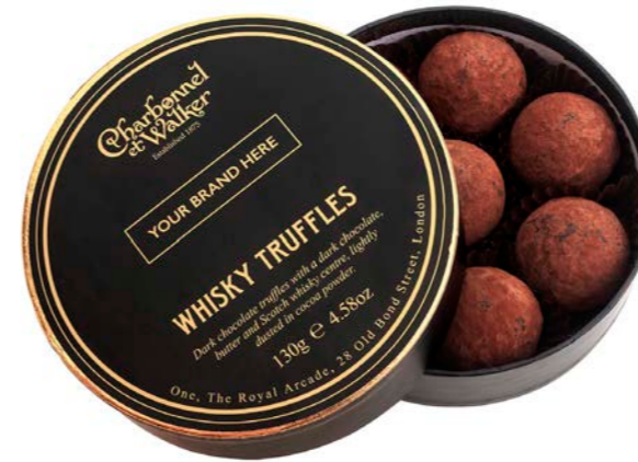
130g Whisky Truffles