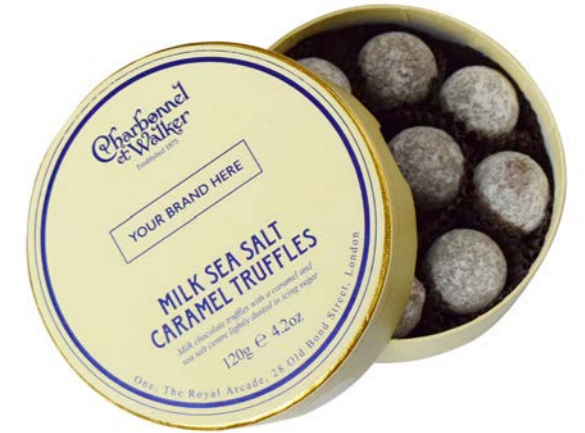
120g Milk Sea Salt Caramel Truffles

Personalise your Corporate Gift with your Company logo with one of our Classic Truffle Gift Boxes.