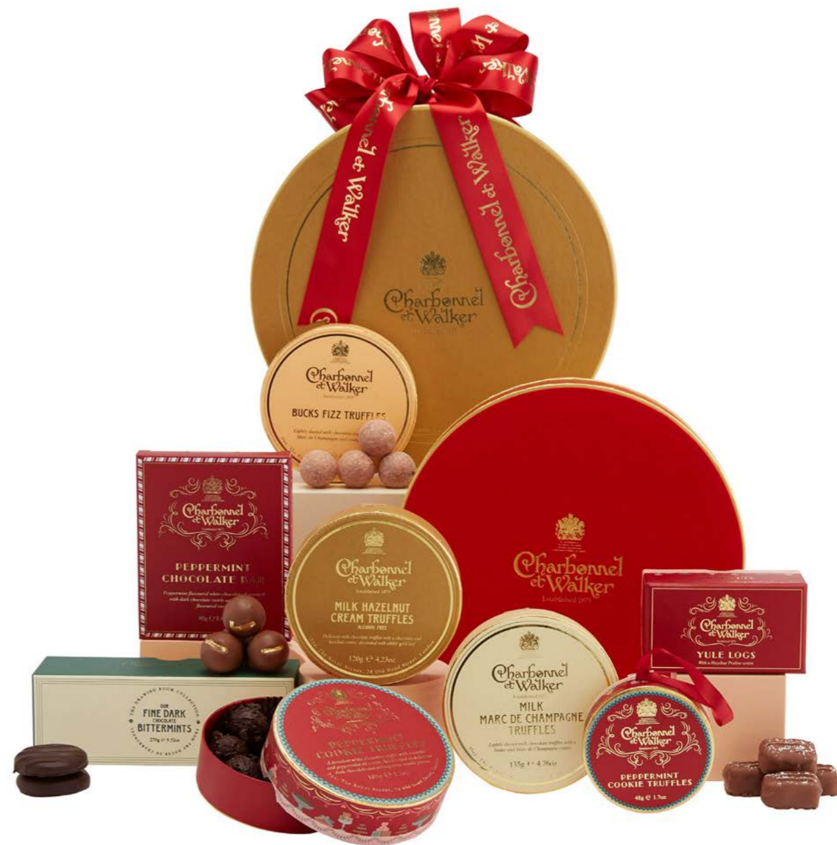
Bond Street Christmas Hamper £210